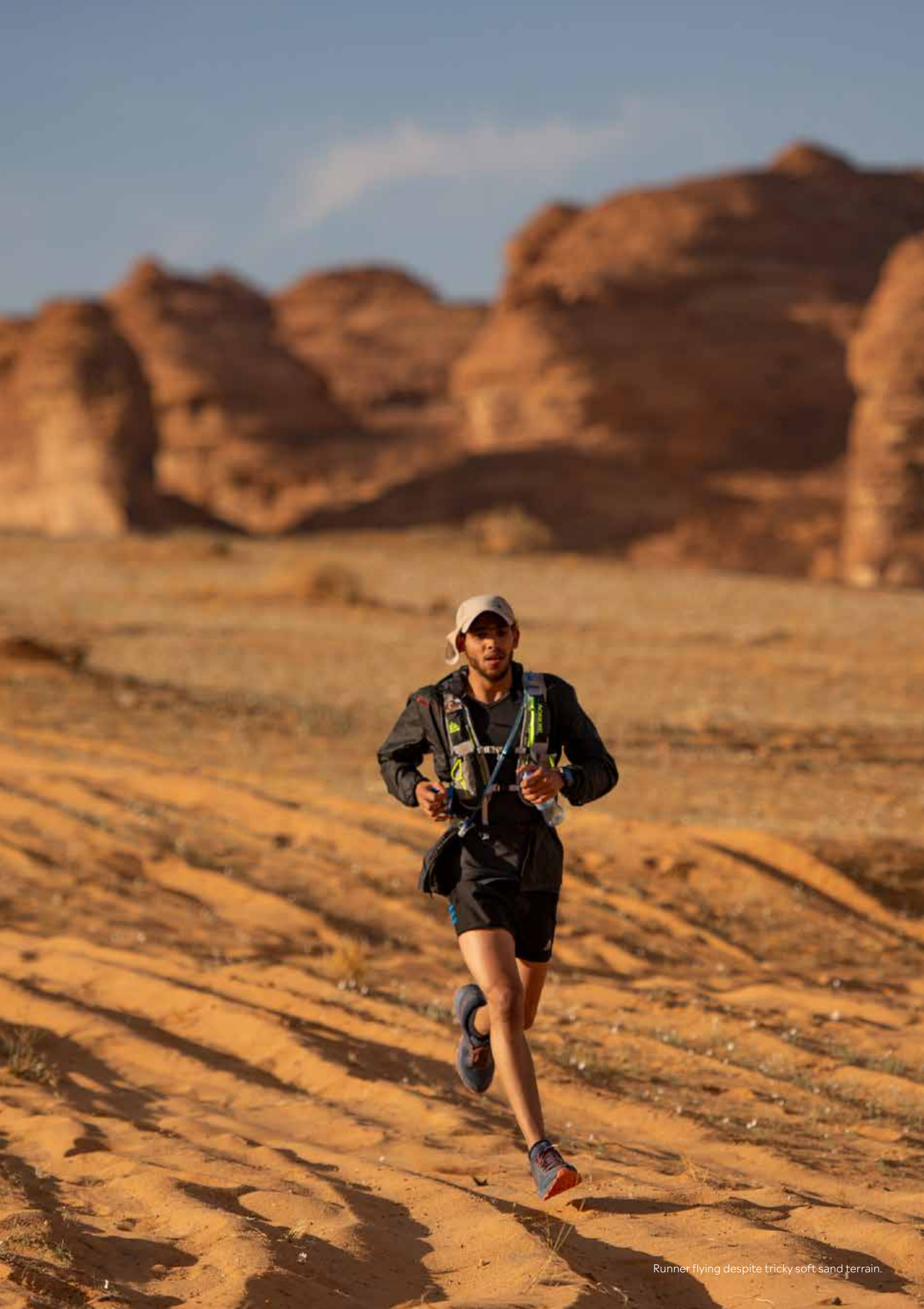
Runner flying despite tricky soft sand terrain.