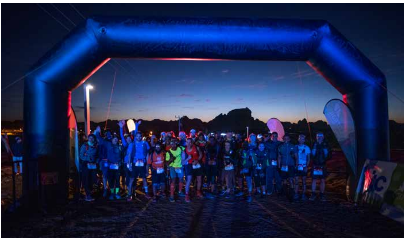
Headlamp on, concentration before the race.